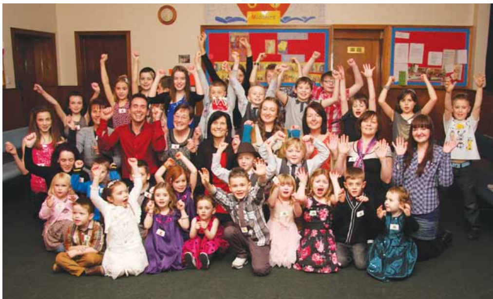
Sunday School Party