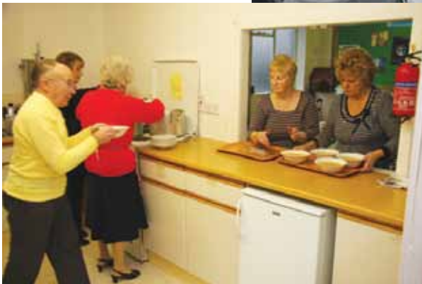
Kitchen and serving staff

More Christmas photographs on pages 8, 9, 10, 11, 12 & 14