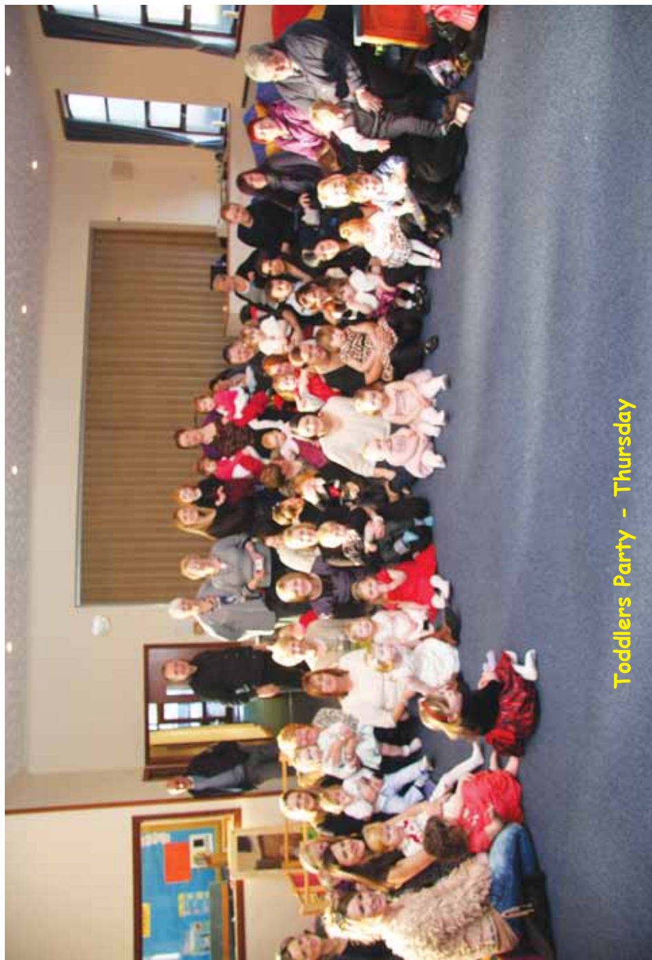
Toddlers Party - Thursday