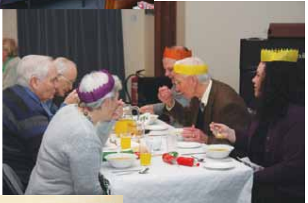
The 'Top Table'