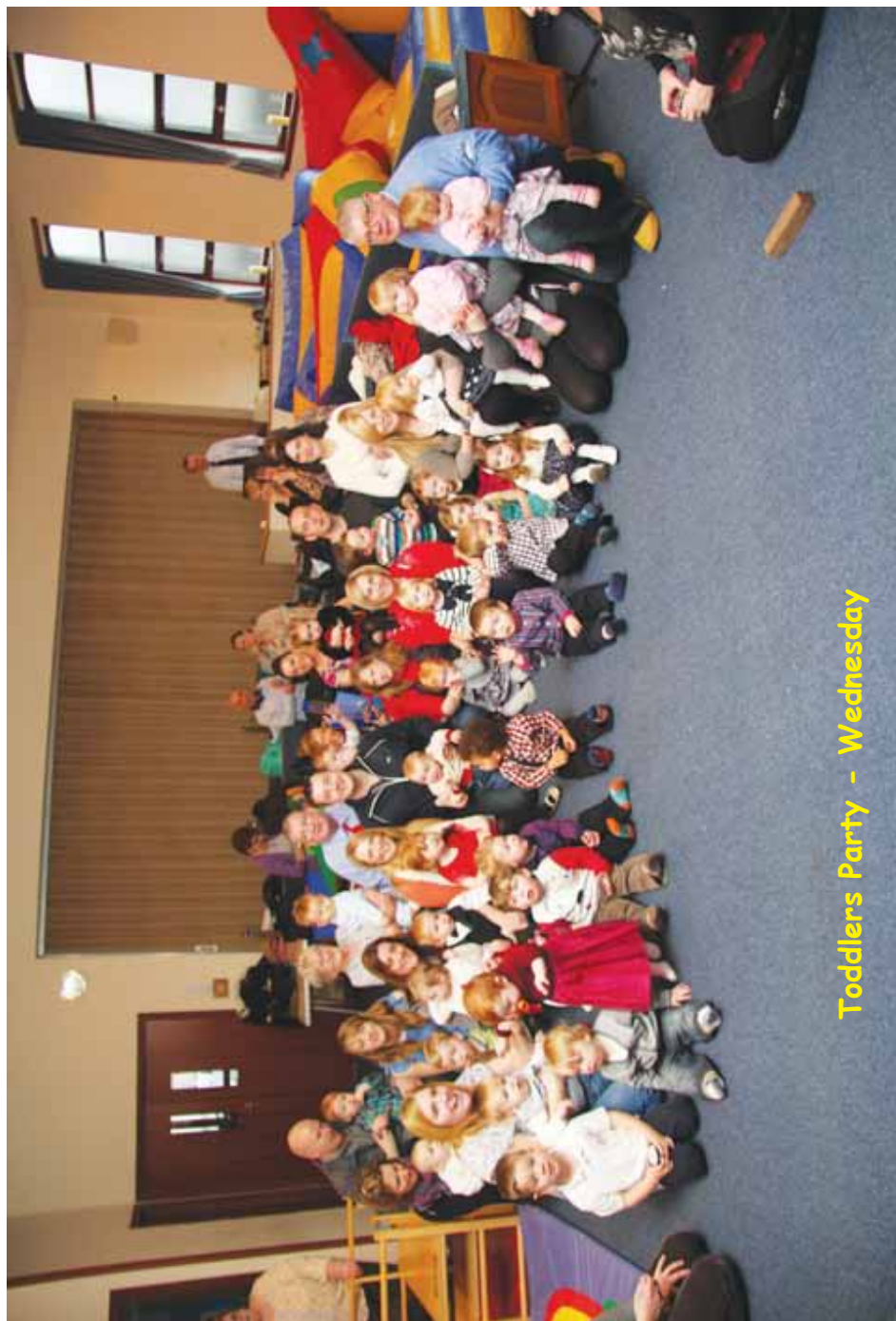
Toddlers Party - Wednesday