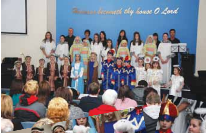
The Sunday School Nativity cast