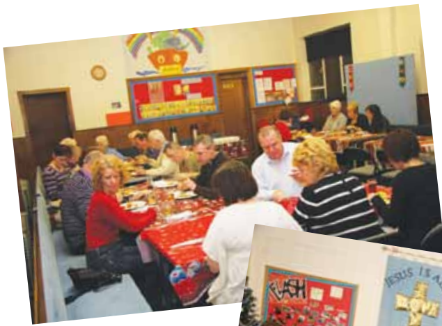
Life Groups having food and fun