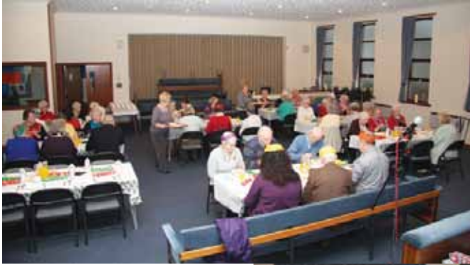
Silver Liners being 'well fed'